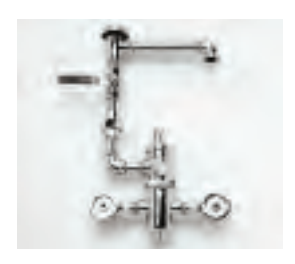
-MXT Thermostatic Mixing Valve