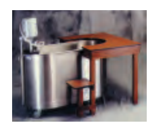
- CTS Combination Table with Seats