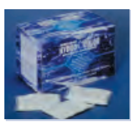
HYDRO-CHLOR An effective whirlpool sanitizer for the treatment of burns and open wounds.