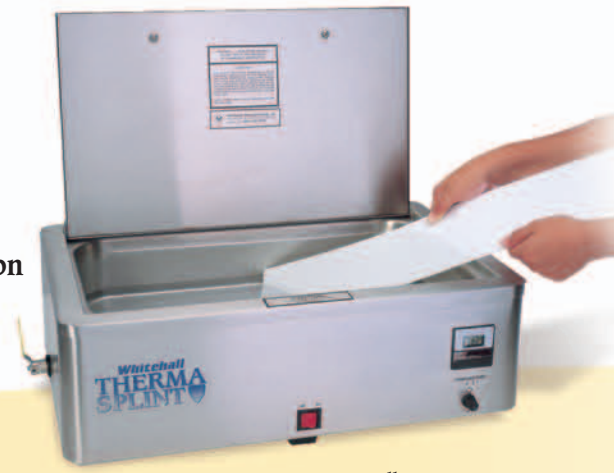
TS-1 (4.6 Gallons)