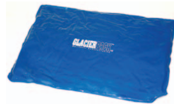
Standard (11"x 14")