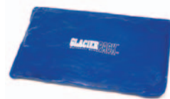
Half-size (7"x 11")