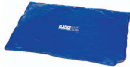
Oversized (13"x 18.5")