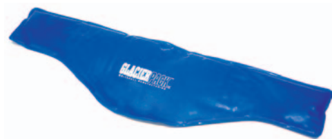
Cervical (23" long)