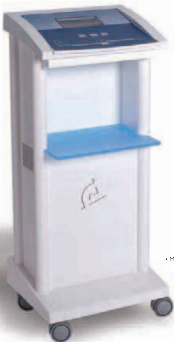
• MAC1255 - PRESSOMED 707 KP