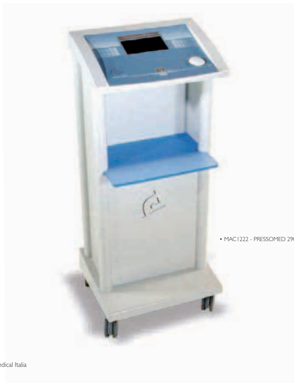
• MAC 1222 - PRESSOMED 2900