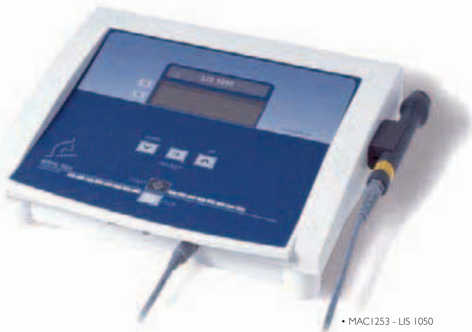
• MAC1253 - LIS 1050