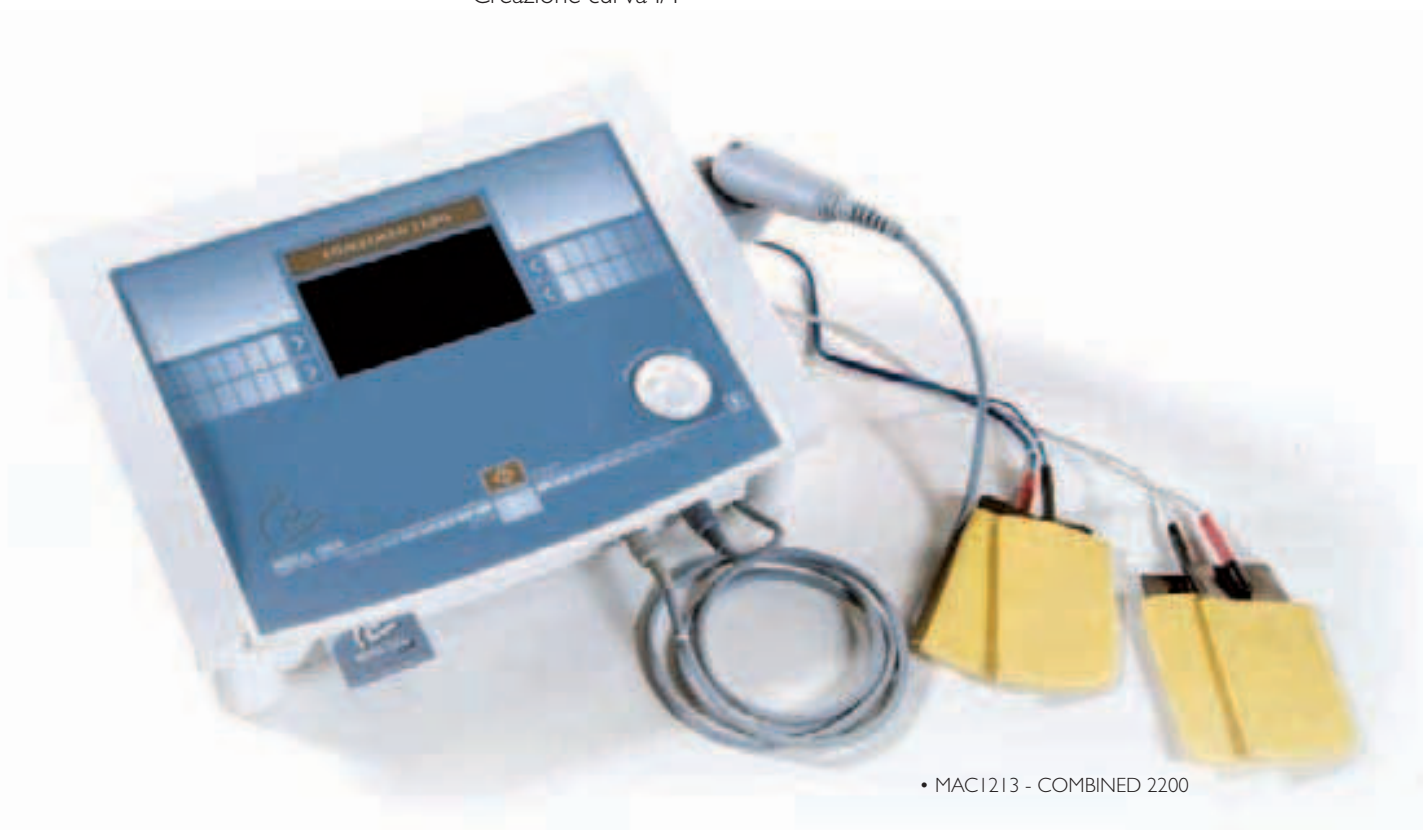
• MAC I213 - COMBIMED 2200