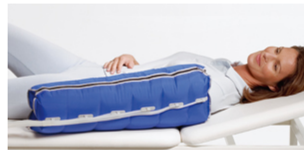
arm sleeve with 6 air chambers full-length zip

Size L: thigh circumference 83 cm, length 85 cm