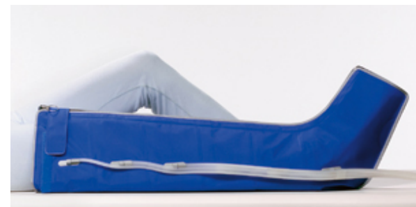
leg sleeve with 6 air chambers full-length zip, Velcro fastening

Size M: thigh circumference 70 cm, length 85 cm